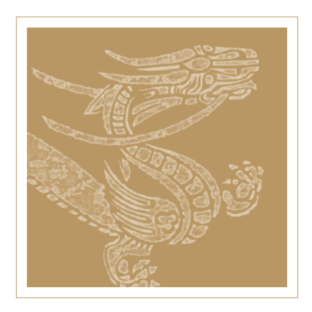
"We take the long-term view when it comes to making investment decisions, and, in so doing, believe we can ride out these short-term waves of changing macroeconomic policy."